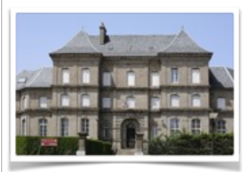
This is the Prison. It was constructed in 1860 and later commissioned in 1868.

This is the Prefecture. A building where many french citizens go to have various forms and important documents checked out. Even to get their driving permit.