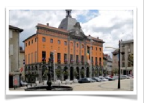
This is the Town Hall, or also known as Mairie d'Aurillac in french.

View of the town and right in the center is Saint-Gérald Church. Thought to be the start of the town.